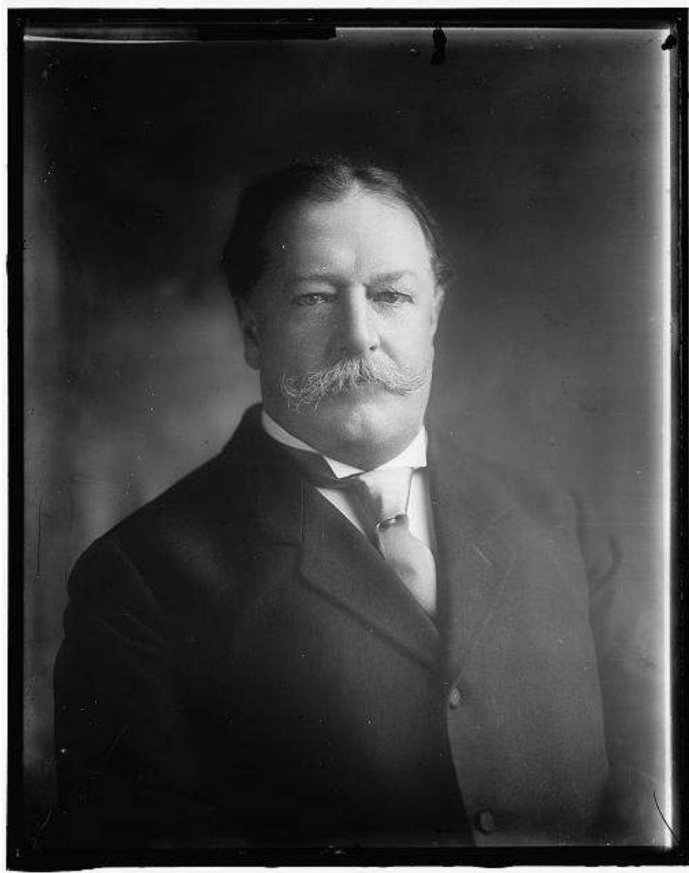
William Howard Taft Secretary of War (ca. 1904-1908).